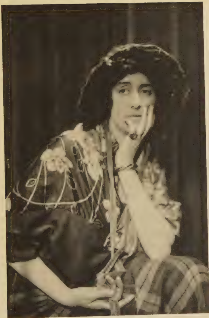
Orlando about the year 1840